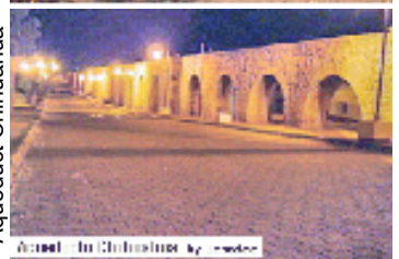
Aqueduct to Chihuahua by -w-ee-