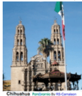
Chihuahua Fotocromo by RS-Camalen