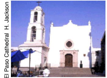
El Paso Cathedral

Perhaps- Pike's observations on the Royal Road paid off during the Mexican American War.