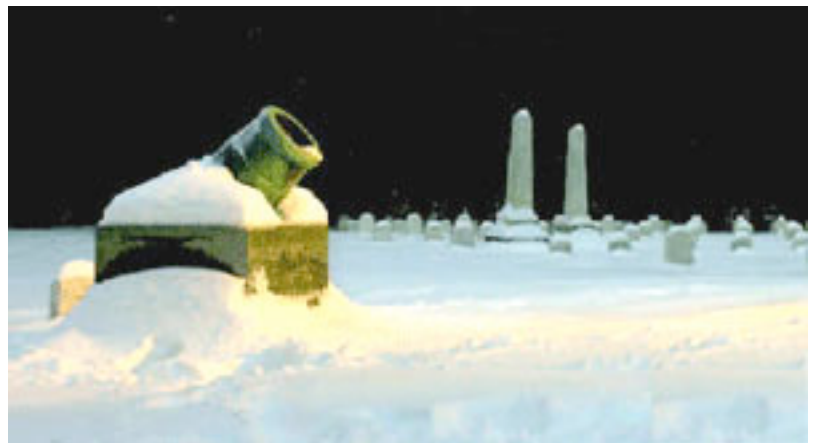
Pike's grave in Sackets Harbor, New York

-Zebulon's led the southwest expedition with the rank of Lieutenant, was promoted (without his knowing) to Captain in 1806, Major - 1808, Lt. Colonel - 1811 (serving in the 4th Infantry Regiment at the Battle of Tippecanoe,) Colonel- 1812, and Brigadier General - 1813.