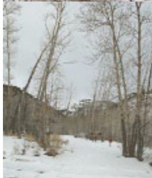
footsteps toward Medano Pass beside the Dunes. I was doing what

Pike and his men did so long ago- walking out there. She also showed me where John C. Frémont closed the Sangre de Cristo mountains.