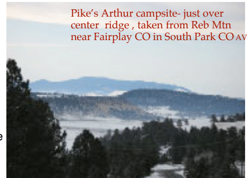
Pike's Arthur campsite- just over center ridge, taken from Reb Mtn near Fairplay CO in South Park CO AV

-I felt the cold in South Park near the former town of Arthurs near