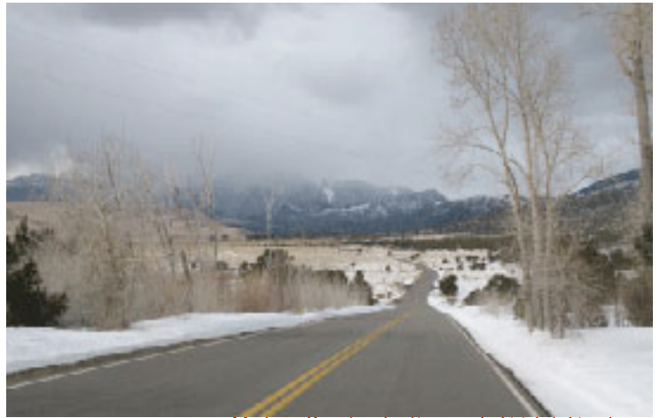
Medano Pass (center Sangre de Cristo), Great Sand Dunes NP (left) AV