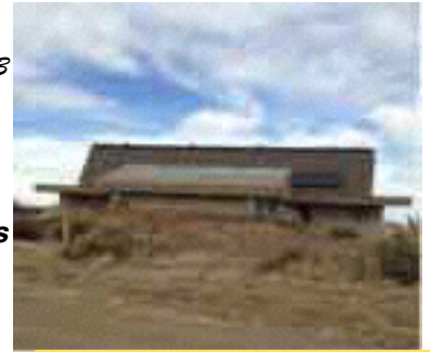
Alamosa National Wildlife Refuge Visitor's Center

Rio grande crossing- continues January 31st “As there was no timber here we determined on descending until we found timber, in order to make transports to descend the river with, where we might establish a position that four or five might defend against the insolence, cupidity, and barbarity of the savages, while the others returned to assist the poor fellows who had been left behind at different points. We descended 18 miles, when we met a large branch [Rio Conejos], emptying into the main stream, about five miles up which branch we took our station. Killed one deer. Distance 18 miles”