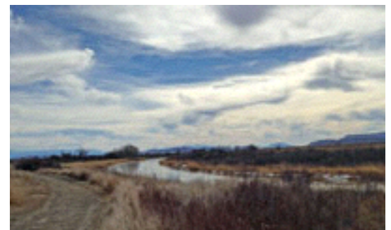
The Rio Grande near the Alamosa National Wildlife Refuge Visitor's Center

January 30th. "We marched hard, and arrived in the evening on the banks of the Rio del Norte, then supposed to be Red river. Distance 24 miles"